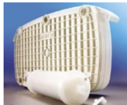
MILLIPORE CORPORATION (WWW.MILLIPORE.COM)

adventitious virus removal while successfully resolving those issues. It must be pointed out that this method is tested only in certain virus filters from Millipore Corporation ( www.millipore.com ).